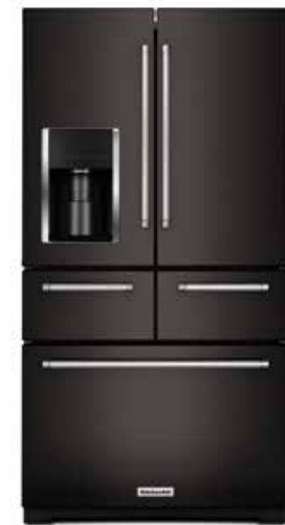
IN THE DARK Multidoor freestanding refrigerator in black stainless steel, $3,999, by KitchenAid

Leaders in fashion and furniture design have been mixing metals for ages now, so why not in the kitchen too? To celebrate 10 years of partnership with San Francisco-based designer Fu-Tung Cheng , Zephyr has created the limited-edition Okeanito ventilation hood in rose gold and black-mirror stainless. Cheng's style-setting range hood also features cutting-edge LED lighting. $3,499, KIVA Kitchen & Bath , 7550 Miramar Road, Ste. 550, San Diego, 858.433.9200, kivahome.com