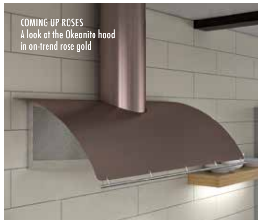
COMING UP ROSES A look at the Okeanito hood in on-trend rose gold